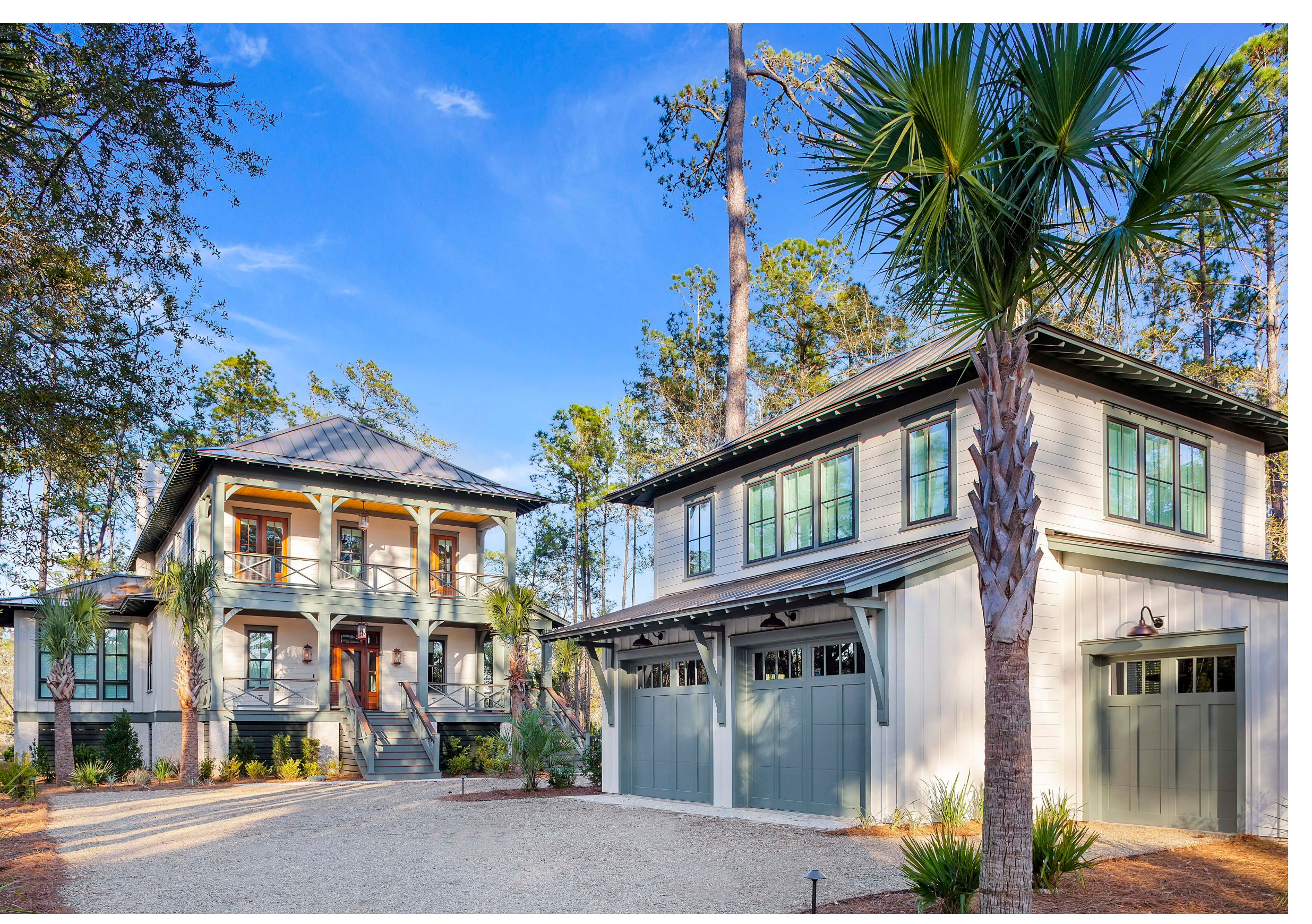
Builder: Boshaw Residential. LLC Architect: Pearce Scott Architects Interior Designer: Kelly Caron Designs, ASID