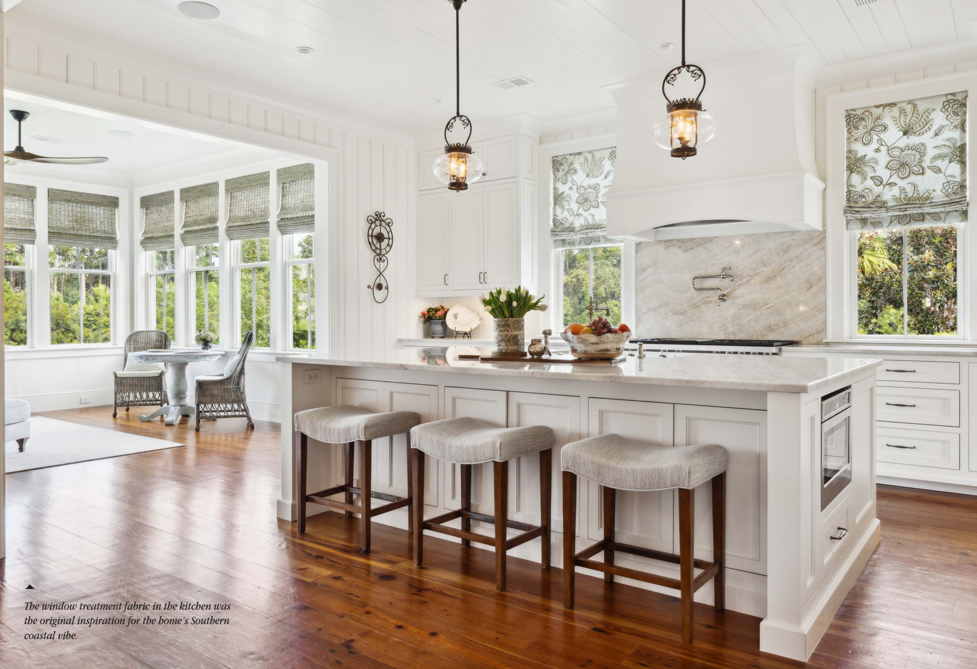
The window treatment fabric in the kitchen was the original inspiration for the home's Southern coastal vibe.