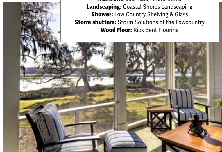
CATCH THE SUN Outdoor living on the Okatie River begins with brilliant daily sunrises.