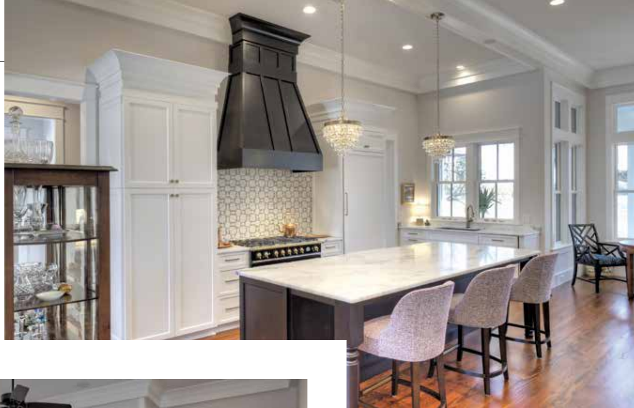
ALL GOOD WITH THE HOOD A custom matte finish range hood is the centerpiece of the Adams' kitchen, offset by elegant ivory tile.