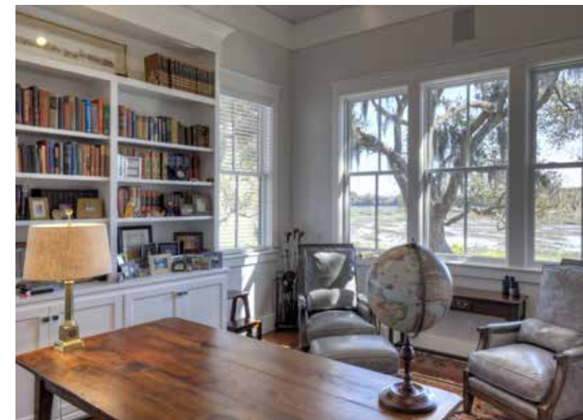
A WELCOME SIGHT Sweeping marsh views prevail throughout the bright open Oldfield retreat, from great room to study.