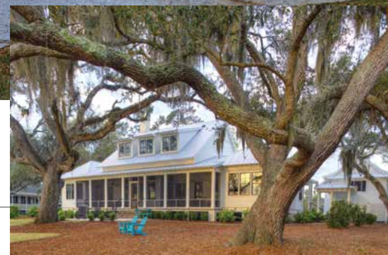
NATURAL WONDERS The iconic grace and grandeur of surrounding Live Oak trees were preserved by builder Ron Boshaw.

The classic clapboard-sided home features most of the living space on the first floor, including a spacious master suite and generous study, each at opposite ends of the open floor plan. "We wanted to keep the private living spaces secluded and away from the common areas where we